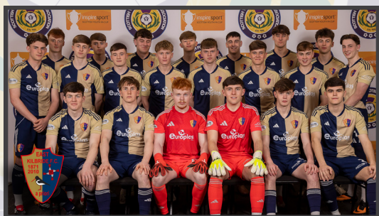
East Kilbride FC