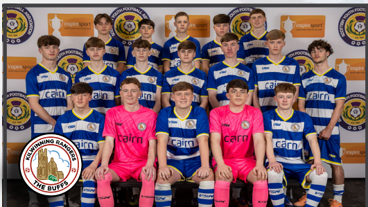
Kilwinning Rangers FC Madrid