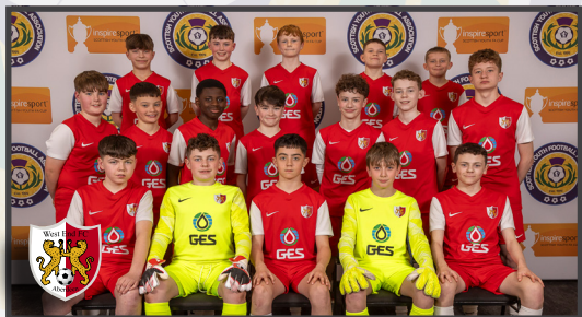
West End FC