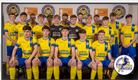
Cumbernauld Colts FC Black