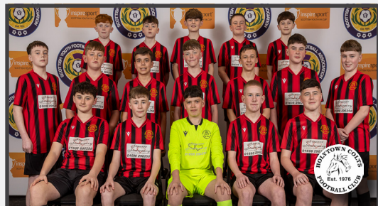
Holytown Colts FC